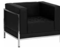
SORRENTO CHAIR BLACK