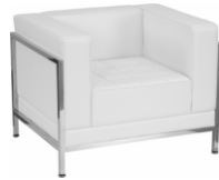
SORRENTO CHAIR WHITE