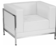
SORRENTO CHAIR WHITE