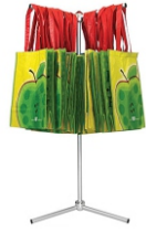
Tote Bag Holder

Looking for an item you do not see? Please call our office for availability and pricing.